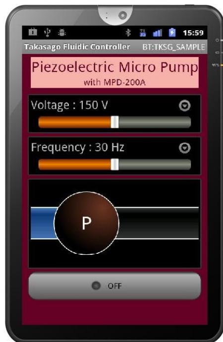
Operation Screen Image